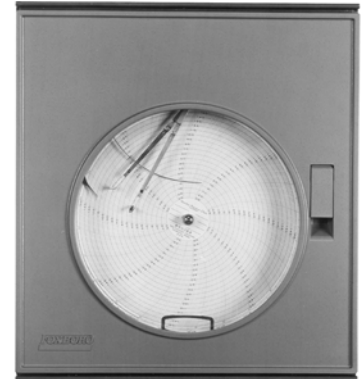
CIRCULAR CHART RECORDER

These instruments are used wherever precise chart records, indication, or control of pressure measurement is required. They record on a circular chart, or indicate on a sector scale or concentric scale. The recorders and sector scale indicators are available with up to four pens and two pointers, respectively. The concentric scale indicator is available with one pointer. The controllers control one or two measurements while the control elements transmit a standard pneumatic signal to a final operator that may be as far as one hundred metres (three hundred feet) distant.