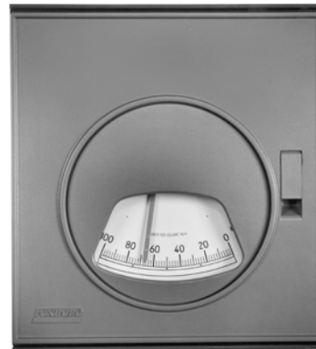
SECTOR SCALE INDICATOR